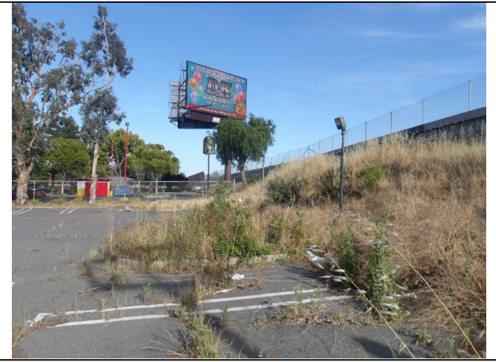
Rear parking area- adjacent to Hwy4