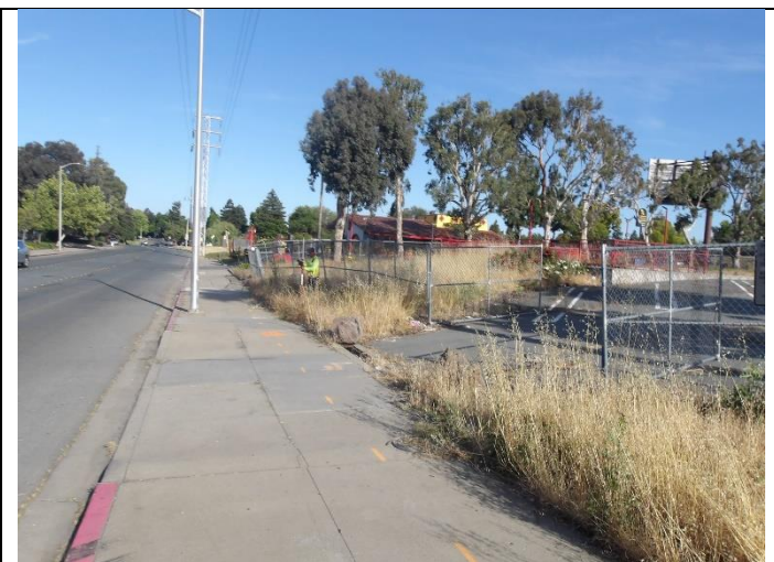
Entry from Mahogany Way