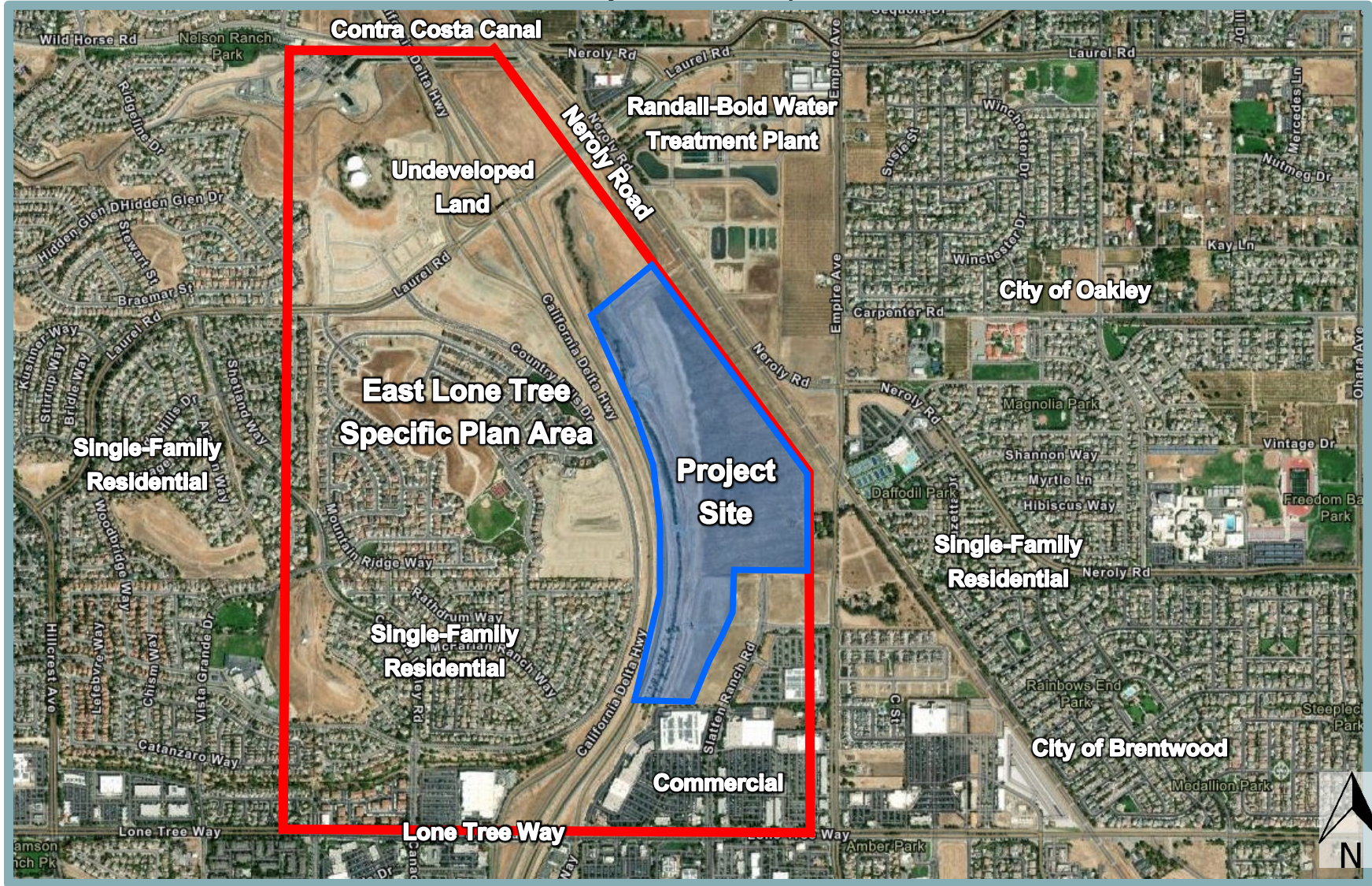
Project Location Map